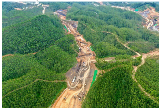
Figure 1. Infrastructure development project area by PT Wijaya Karya (Persero) Tbk which is integrated with reforestation area around the forest