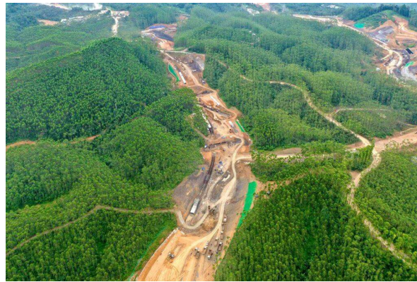
Figure 1. Infrastructure development project area by PT Wijaya Karya (Persero) Tbk which is integrated with reforestation area around the forest

PT WIKA shows a high commitment to environmental preservation, which is reflected through various environmentally friendly initiatives in construction and infrastructure projects. The company implements systematic energy efficiency, emission reduction and waste management policies. One example is the application of low-carbon construction technology and building material recycling systems. In addition, WIKA is also actively reforesting and providing green open space around the project site.