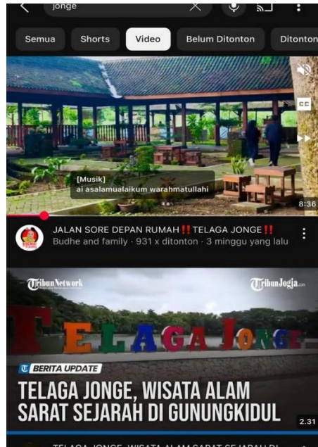
Figure 4.3 Telaga Jonge Youtube account (accessed on January 8, 2025).

This study evaluates the implementation of the Smart Branding concept at Telaga Jonge Tourism Area as part of the implementation of Regent Regulation No. 24 of 2023 on the Smart City Masterplan in Gunungkidul Regency. Using Edward III's policy implementation theory, the research focuses on four key indicators: communication, resources, disposition, and bureaucratic structure.