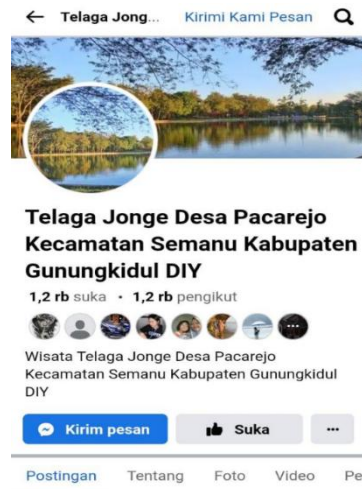
Figure 4.2 Telaga Jonge Facebook account (accessed on January 7, 2025)